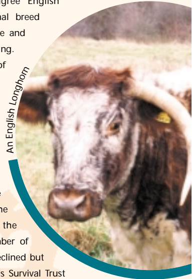
An English Longhorn

The English Longhorn is one of the rarer British breeds of cattle, having originated in north-west and central England and Ireland. During the latter half of the eighteenth century it was the most widely used breed for meat production before being replaced by the Shorthorn breed early in the nineteenth century. The number of English Longhorns steadily declined but the efforts of the Rare Breeds Survival Trust have helped to save it from extinction. The cattle are red-brown or brindled with a white back.