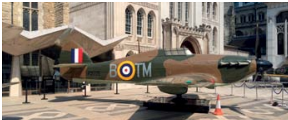
The "RAF 100" programme comprises 6 months of events across the UK.

To mark this the City Corporation hosted a mid-week early evening reception in Guildhall to which many past and current RAF service personnel were invited. Great Hall and The Old Library were both packed. All ranks with so many experiences wearing their best uniforms. An engineer I spoke with said his normal work gear is greasy overalls. Medals a-plenty, service in Afghanistan, Iraq, for example. The Lord Mayor and The Chief of Air Staff both spoke, firstly in Great Hall and then in the Old Library.