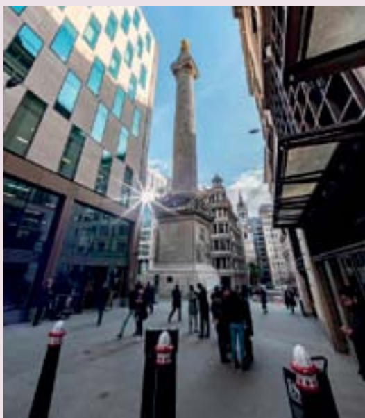
The Monument stands on the intersection of Fish St Hill and Monument Street

which they purchase a ticket inside a tiny corridor, then enjoy the views from the top. In other words, there simply isn't space for anything other than climbing and descending its 311 steps...until now.