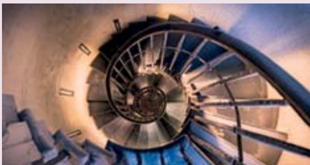
Visitors climb 311 steps to reach the Monument's viewing platform

So the question remains, why is this very interesting part of the Monument's history so little-known? In truth, the visitor experience at the Monument simply does not currently have scope for retelling this tale and many others: its 200K visitors per year enter through a narrow stone tunnel, after