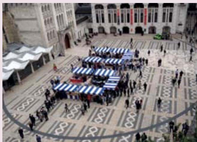
Thursday food market in Guildhall Yard

Culture and education – extending the City Corporation's support for a wide range of schools in (and outside) London and promoting the City's Cultural Mile project and strategy to attract more visitors to the Square Mile.