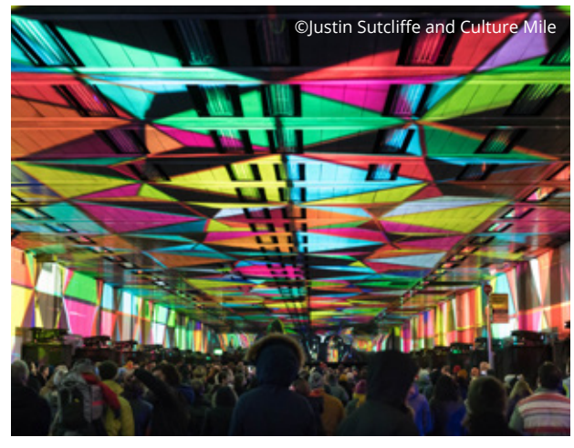
Tunnel Visions Array, created by 59 Productions as part of Barbican OpenFest