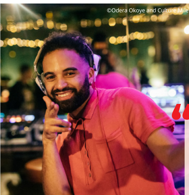
Culture Mile Nights -Oi Barman in the City event