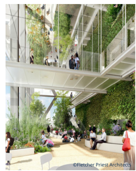
Concept design for the garden terrace at 55 Gracechurch Street