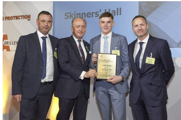
The Inner City Scaffolding team collecting their Scaffold Gold Award

Inner City Scaffolding for Skinners Hall