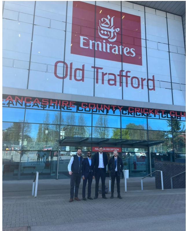
City of London staff assessing the conditions ahead of the HAUC(UK) Conference

For further information on the conference and the content, please go to the following address