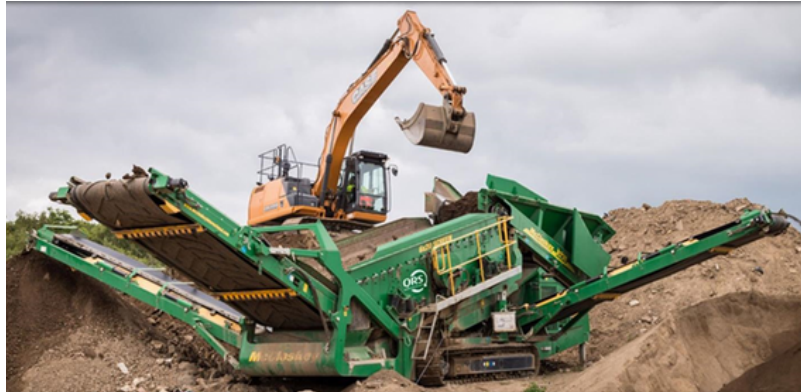
The Scratchwood Quarry recycling facility in full flow

The Recycled Material Full Circle delivered by Stanmore Quality Surfacing's group company, Quality Recycling Solutions, has been recycling material since 2007, including fully certified recycled 803 Type 1 and stabilised materials. Their aim was to produce complete full circle of arisings from excavations, to recycled backfill, which they have now achieved.