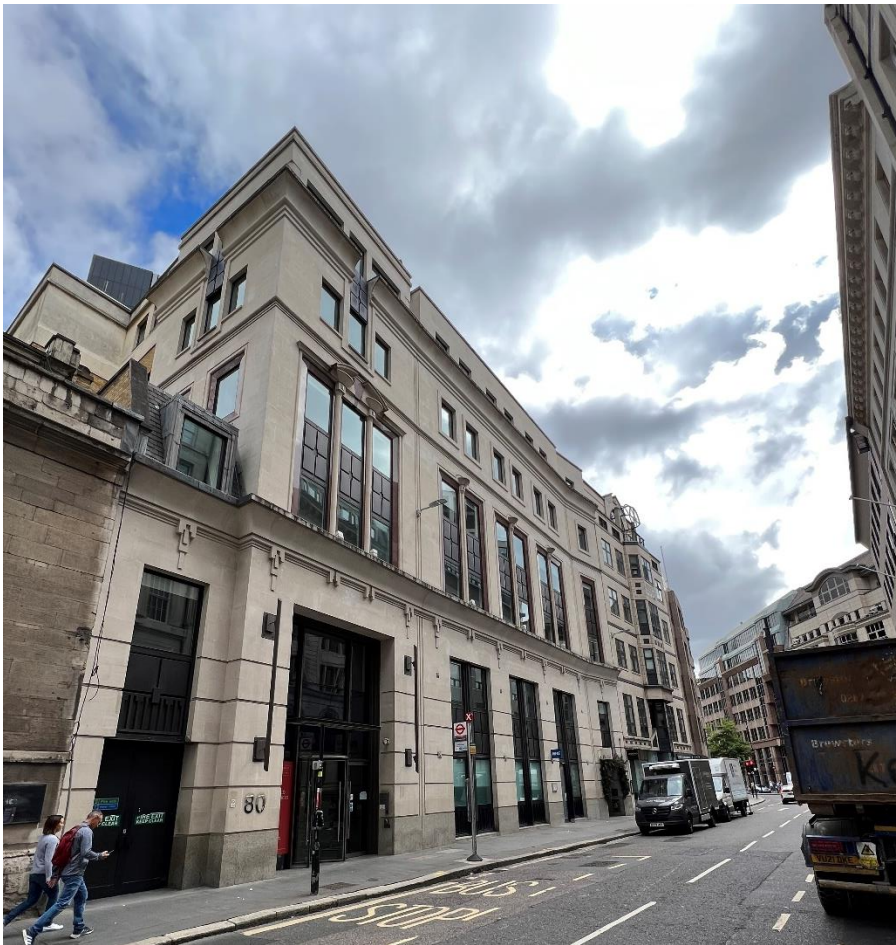
Figure 9: No. 80 Leadenhall Street

The corner plot of Leadenhall Street and Mitre Street, Nos. 71-77, is a prominent corner site and one of the key gateways into the locality from the east. The existing building dates to 1986-7 by Gollins Melvin Ward, of five storeys with two additional floors set-back. The building maintains the scale and building line of the street block, with the curved SE corner of the building forming a point of architectural interest; through windows here can be seen a section (grade II listed) of the Holy Trinity Priory comprising a tall late C14 Gothic window arch relocated here from another site.