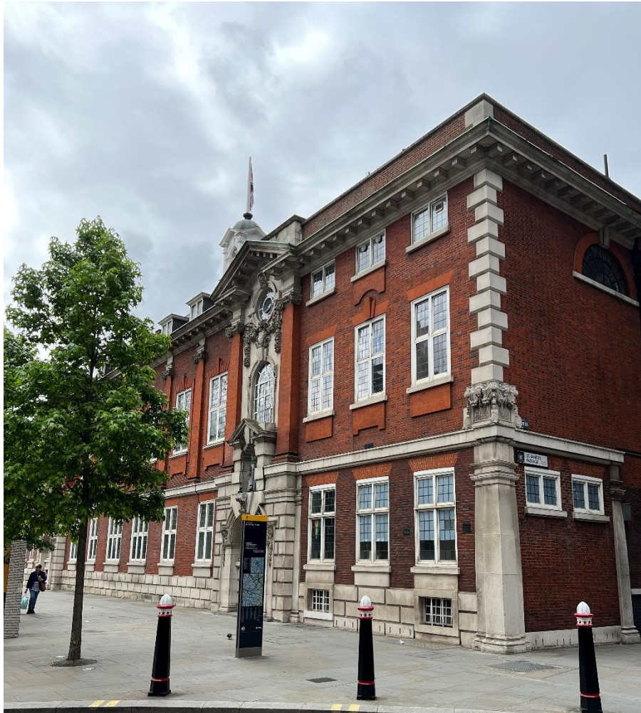
Figure 5: Aldgate School

East of the school extends Aldgate Square, one of the largest open spaces within the City. The Square was formally opened in 2018 and includes a central lawn area flanked by raised planters which provide informal seating, tree planting on the southern boundary; and a water feature. The cafe on the square, Portsoken Pavilion (named after Portsoken ward), was designed by Make.