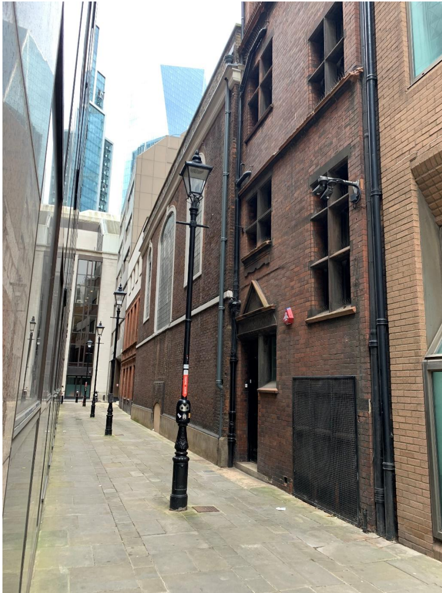
Figure 8: Heneage Lane

Just north of the Synagogue building and attached to it is the Rabbi's House, No.2 Heneage Lane, dating from the 19th century (between 1875 and 1916). The part of the building facing onto Heneage Lane is of red brick with red Mansfield stone dressings with Tudor detailing and a plainer stock brick elevation to the Synagogue courtyard. Although of different style to the Synagogue, the patina, texture, colour tones and modesty of the Rabbi's House makes it a sympathetic neighbour.