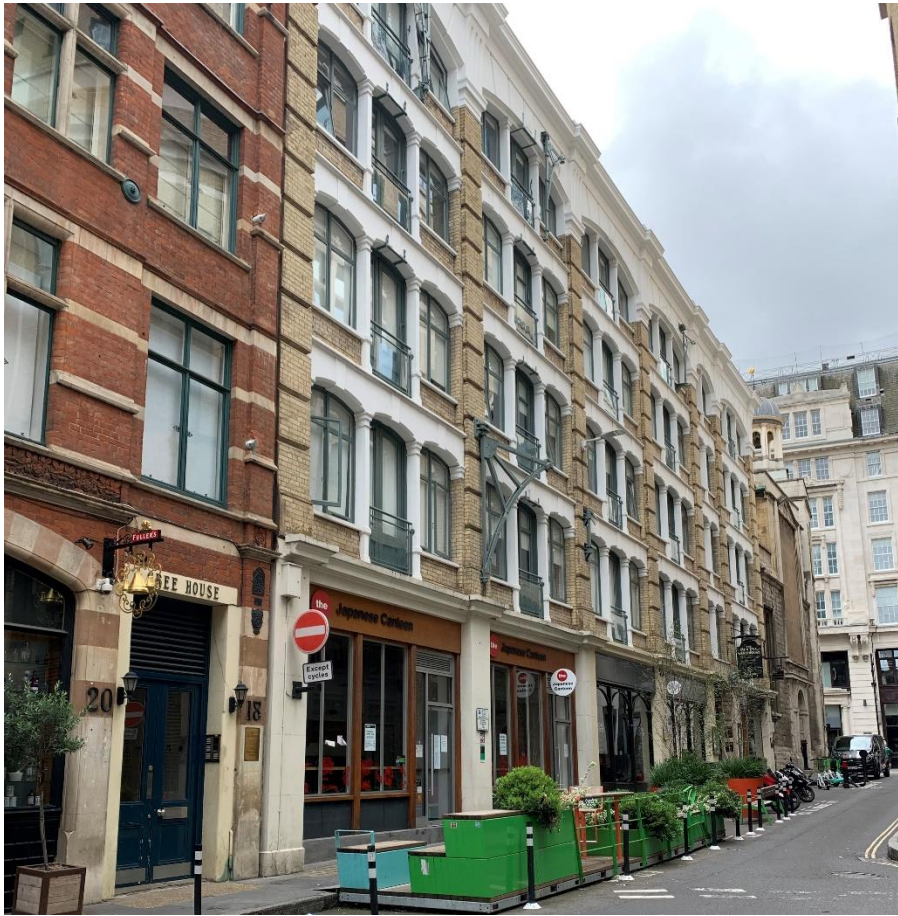
Figure 1: Historic Warehouses, Creechurch Lane

The neighbouring group of warehouses includes Nos. 2-16 Creechurch Lane, a grade II listed tea warehouse building of 1887. The building is five storeys high, of brick, iron and stone and gives a typical flavour of the locality. It incorporates many surviving warehouse features such as external cranes and loading bays which contribute to its special historic and architectural interest and also its townscape value. The complex forms a group with the warehouse buildings immediately to the east and on Mitre Street.