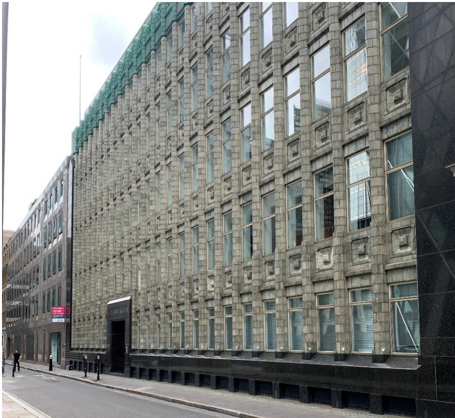
Figure 6: Holland House, Bury Street

To the south, Nos. 5-10 (Copenhagen House) is an office building, constructed in 1977 by Hildebrandt & Glicker. The building has an imposing presence within the street, due to its width but also its robustness and pink granite façade. The building has an affinity with the offices of similar date on Leadenhall Street and Mitre Street and is cut from similar cloth to No. 33 Creechurch Lane. Like those, the scale, modelling and layout of this building are in sympathy with its more historic neighbours in the locality.