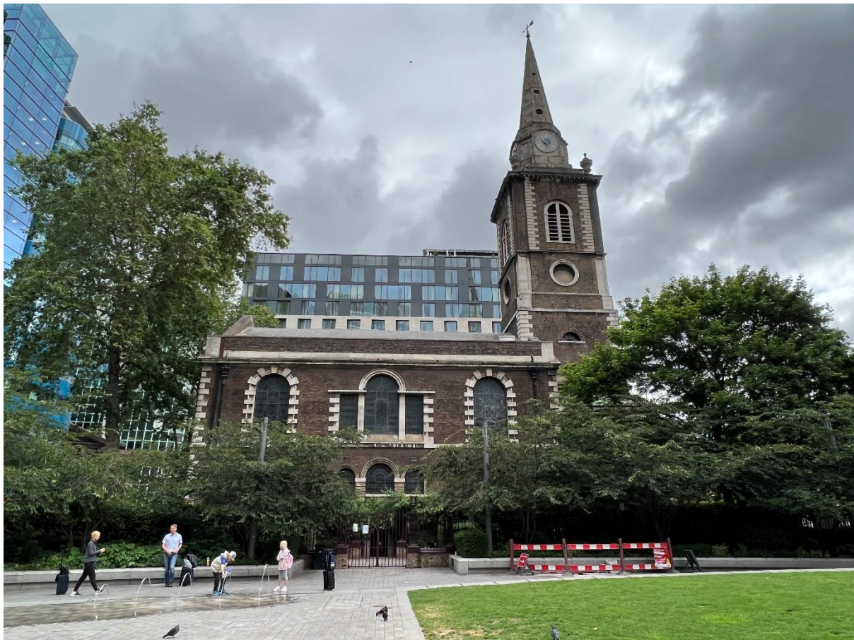
Figure 4: St Botolph-Without-Aldgate

To the west of Leadenhall Street, north of Aldgate is the Grade II* listed Aldgate School ( Figure 5 ). The school dates from 1908 and was formerly located in the churchyard of St Botolph Aldgate and on Jewry Street. It now stands within the site of the former Priory complex on the site of the Priory garden; a sense of openness is retained in the playgrounds, formed on the sites of buildings demolished in the 20th century. In the neo-Wren style, constructed of red brick and Portland stone with a green slate roof. Due to its size arrangement, the building is prominent within the locality and is the focus of a number of views from surrounding streets. The main elevation incorporates a central cupola facing east onto the new pedestrian Aldgate Square while secondary frontages facing onto Aldgate High Street and Mitre Street. Its materiality, scale and detailing reflect the warehouse group at the north end of Mitre Street.