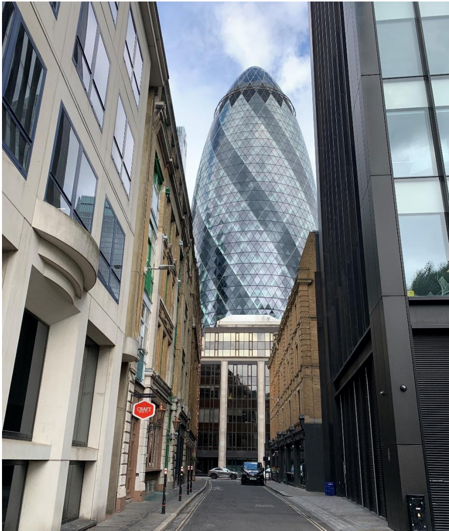
Figure 3: Historic Warehouses on Mitre Street, with 30 St Mary Axe in the background

Nos. 32-40 is a modern stone-faced building of sympathetic scale and modelling, relating well in these traits to the unlisted warehouses adjacent. It constructed in 1991 to designs by Ley, Colbeck and Partners, and incorporates the passageway from Mitre Street into St Katherine Cree churchyard. An open space within the Priory complex, it became a churchyard associated with St Katherine Cree in the medieval period. It ceased to be a churchyard in the 1870s and was converted into a public garden, last relandscaped in the 1960s. The space forms a loose polygon enclosed by the rear of buildings on Leadenhall and Mitre Streets, with a church hall facing to the west. These elevations are of brick or stone and provide an appropriately traditional setting. Unusually, the church is separated from the churchyard. Around the perimeter is York stone paving enclosing a gravelled central area containing chest and table tombs, planting, benches and trees. Just to the east of the entrance is a carved stone gateway, originally placed at the south-east angle of the yard,