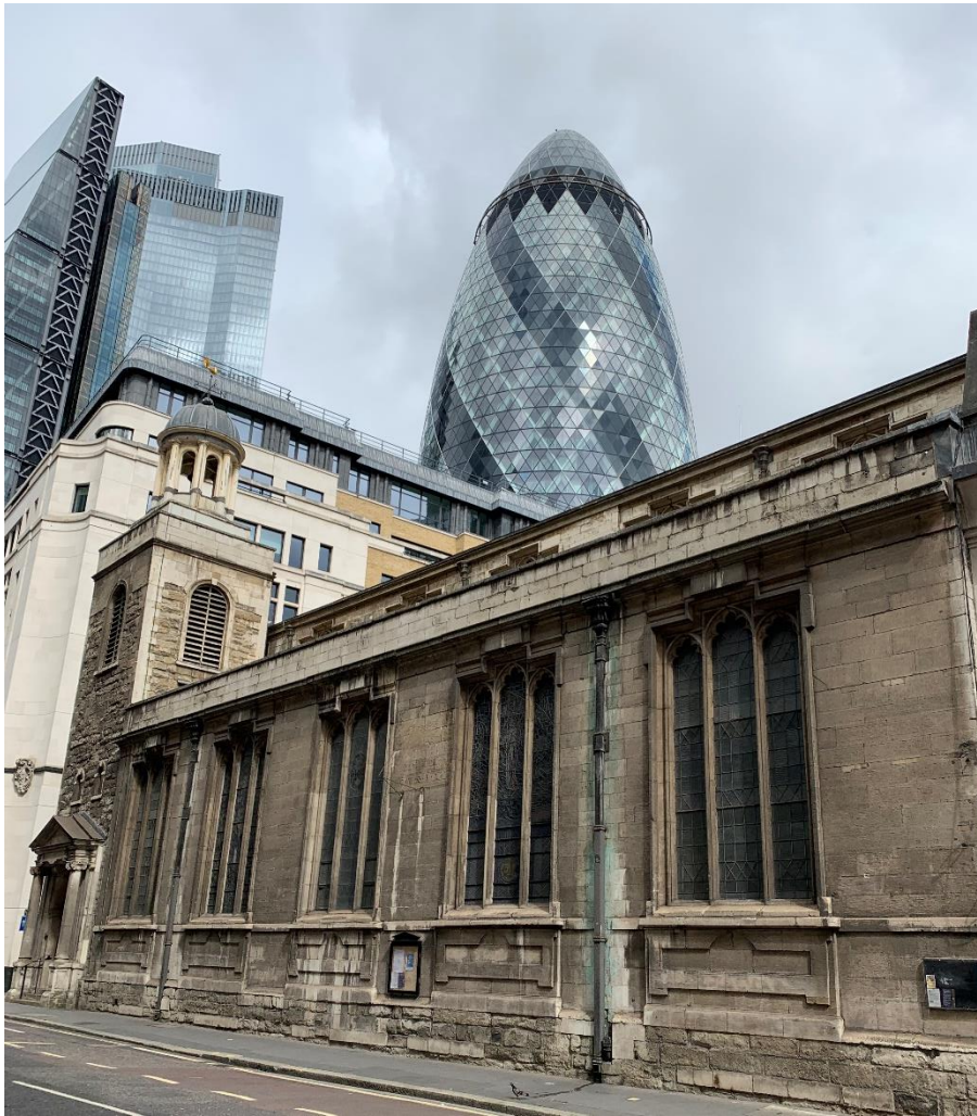
Figure 2: St Katharine Cree

Further north, Fibi House, at Nos. 22 and 24, a pair of four storeyed tea warehouses of 1895, yellow brick dressed with red, above stone-faced ground floors. The building forms the easternmost end of the warehouse group and shares with the others simple brick and terracotta detailing. The building was converted to offices in the mid-20th century but retains a convincing warehouse exterior.