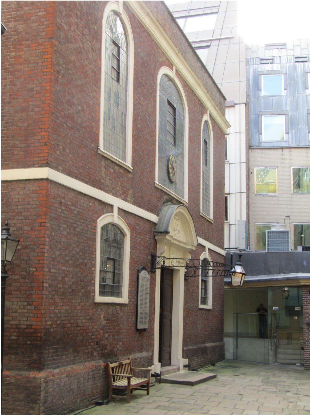
Figure 7: Bevis Marks Synagogue, western elevation

quietness upon entering the courtyard that contrasts strongly with the bustle of the main street, despite the presence of tall buildings in the Cluster beyond these self-contained immediate boundaries The Synagogue has strong functional, aesthetic and historic relationships with the adjacent Rabbi's House (2 Heneage Lane) and the Vestry (4 Heneage Lane).