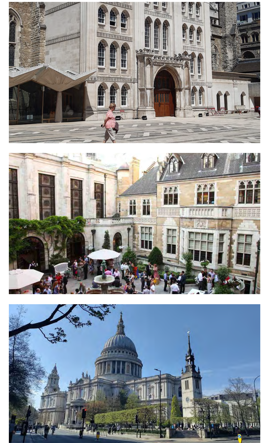
Some of the Square Miles heritage buildings (Guildhall, Merchant Taylors' Hall, St Paul's Cathedral)