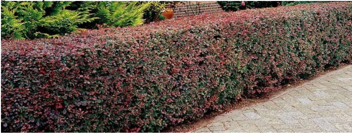
Prickly Berberis hedging

Hostile Planting – strategically placed thorny or prickly plants will delay and deter an individual trying to gain access to a dangerous location. This may be more aesthetically acceptable than a fence or other barrier but may not be as effective owing to ongoing maintenance issues associated with the growth and control of a biological element. The type of plant, its appearance and practical deterrent capability across all seasons should be considered within any assessment. The site arrangements should also consider what steps will be taken if the plants die or wither, so as to remove or significantly reduce the deterrent effect.