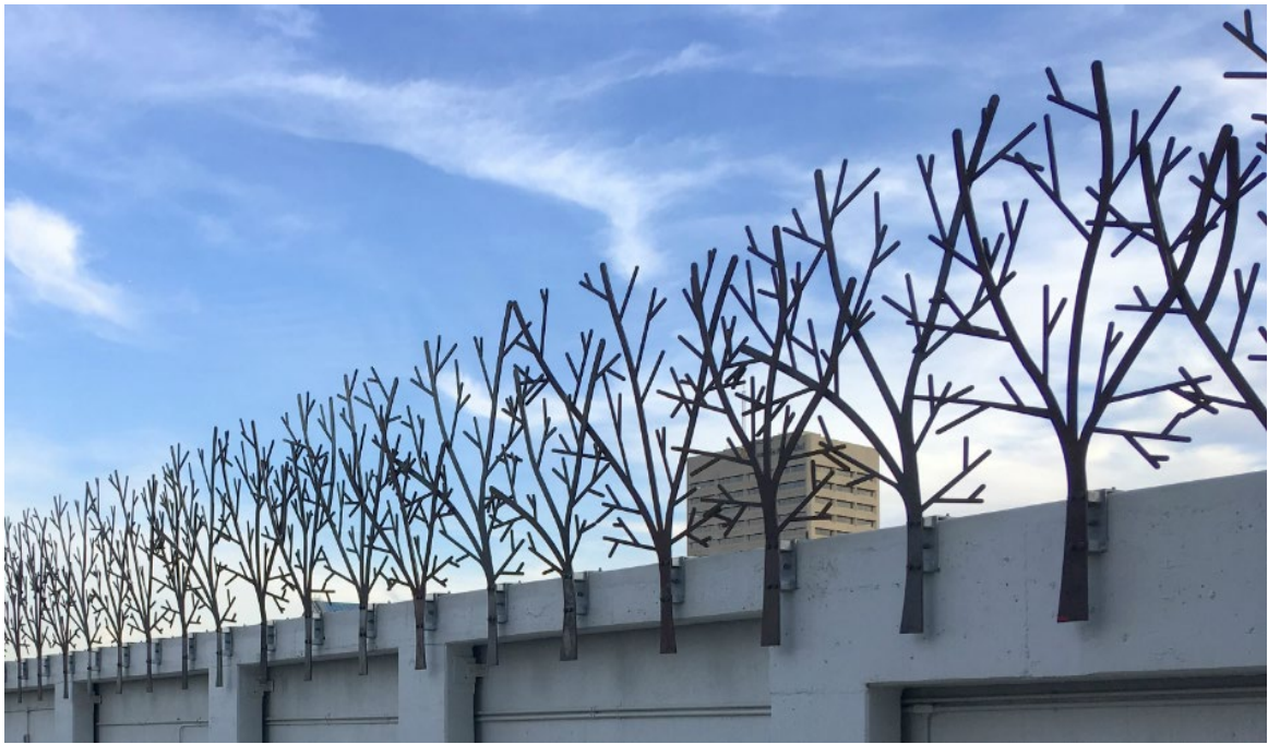
Art installation/ suicide prevention barrier, Canada

Urban greening not only serves a decorative purpose but both acts to increase the building's open space and as a deterrent from accessing the edge of the building, as shown in the examples below.