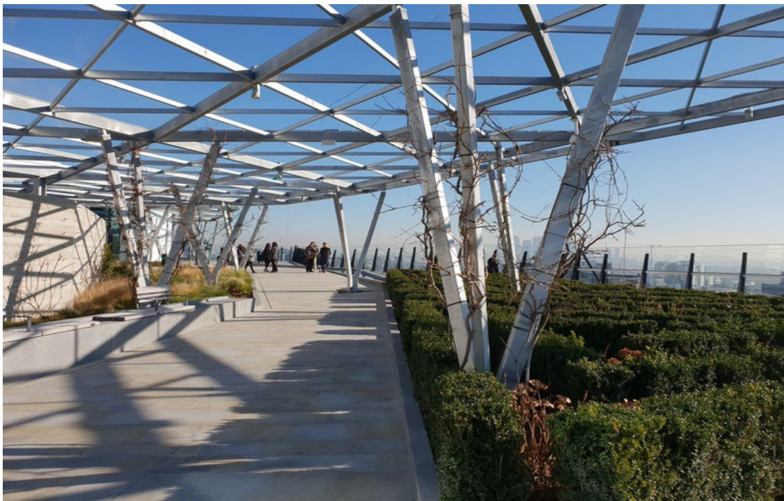
Planting on roof terrace at 120 Fenchurch Street

Urban greening not only serves a decorative purpose but both acts to increase the building's open space and as a deterrent from accessing the edge of the building, as shown in the examples below.