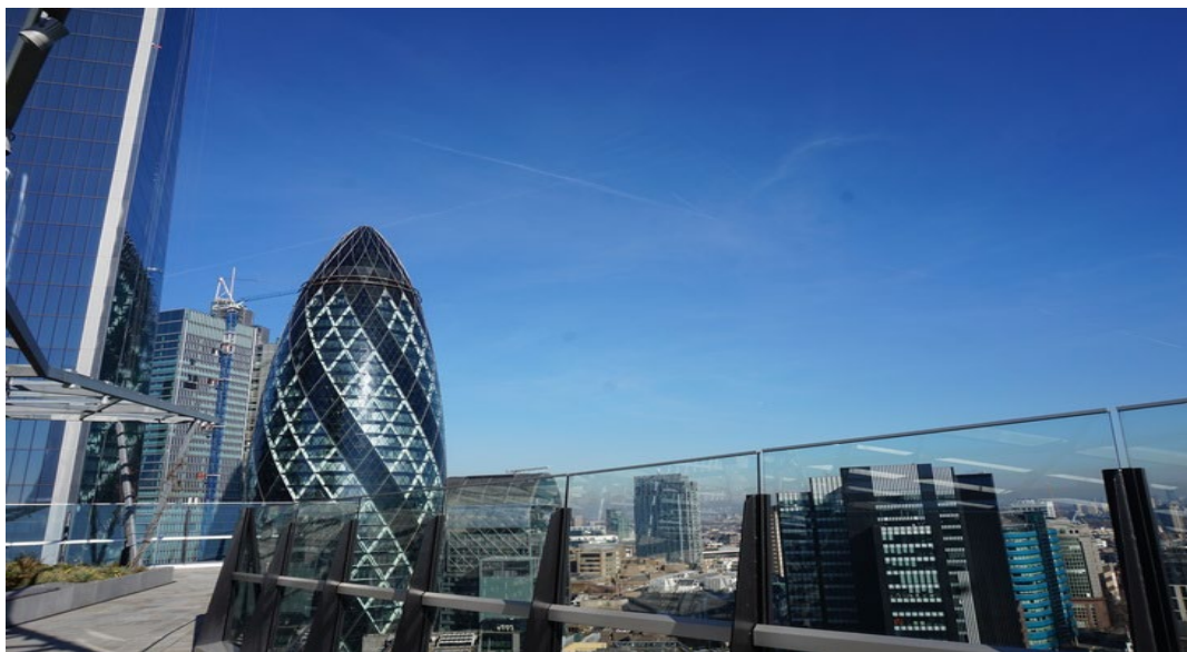
Balustrade on roof terrace at 120 Fenchurch Street

Balustrades can act as physical barriers, separating visitors and employees from the edge of the building.