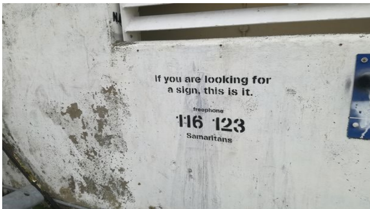
Samaritans Sign, Gloucestershire

It is advised that a combination of physical barriers, staff training and surveillance is implemented in buildings and on structures, to maximise the effectiveness of preventative measures. Measures that increase the potential for human intervention will increase opportunities for the suicidal individual to find help, and thereby potentially securing longer lasting assistance and preventing a return to this or another location.