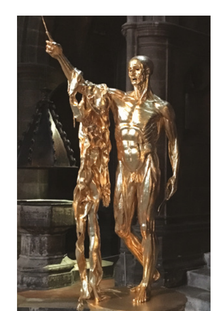
Exquisite Pain by Damien Hirst

Retrace your steps along Milk Street to St Lawrence Jewry, continue left on Gresham Street and right onto St Martin's Le Grand. Walk through Postman's Park (open 8am to 7pm or dusk, whichever is earlier) and turn right on to Little Britain, following it round to the left along St Bartholomew's Hospital. St Bartholomew the Great is down a passage to the right when you reach West Smithfield.