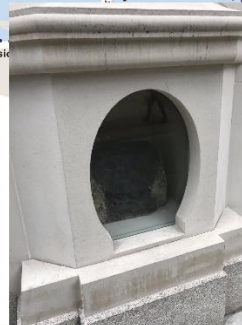
London Stone Possibly the base of a column from a grand house