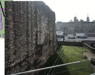
Tower Hill Roman city wall