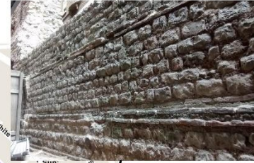
Roman city wall