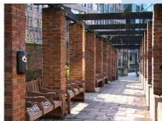
Cleary Gardens Site of the Roman public baths