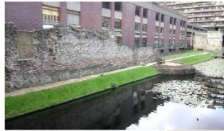
Wall of the Roman fort