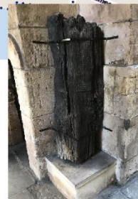
St Magnus the Martyr Timber from the Roman riverside