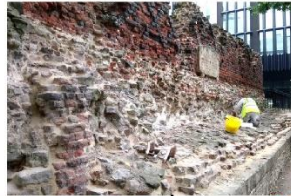
Wall of the Roman fort