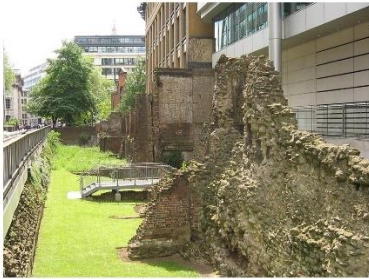
Noble Street Wall of the Roman fort