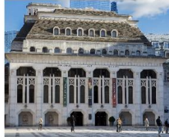
Black line of the Roman amphitheatre wall on the ground