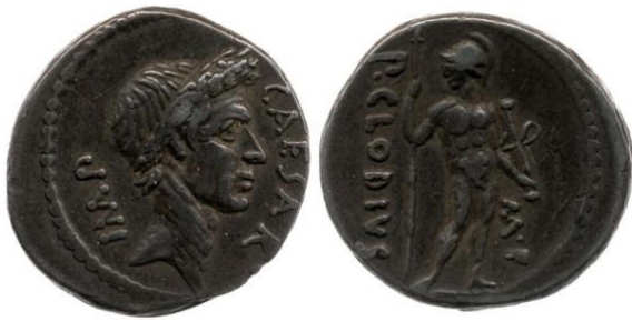
Coin of Julius Caesar © The Trustees of the British Museum.