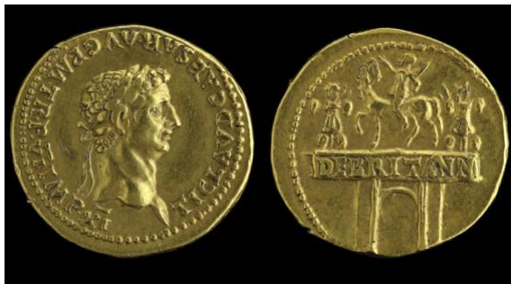
Coin of Claudius