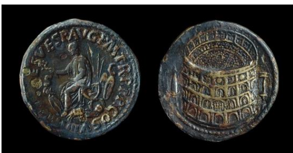
Coin of Titus