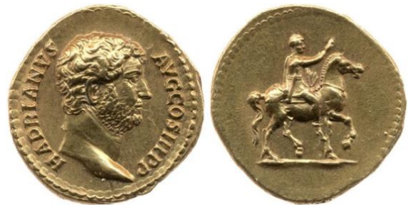
Coin of Hadrian