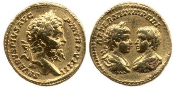
Coin of Septimius Severus