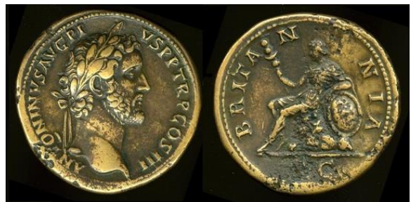
Coin of Antoninus Pius.