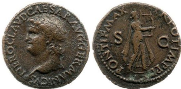
Coin of Nero