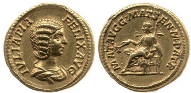
Coin of Julia Domna