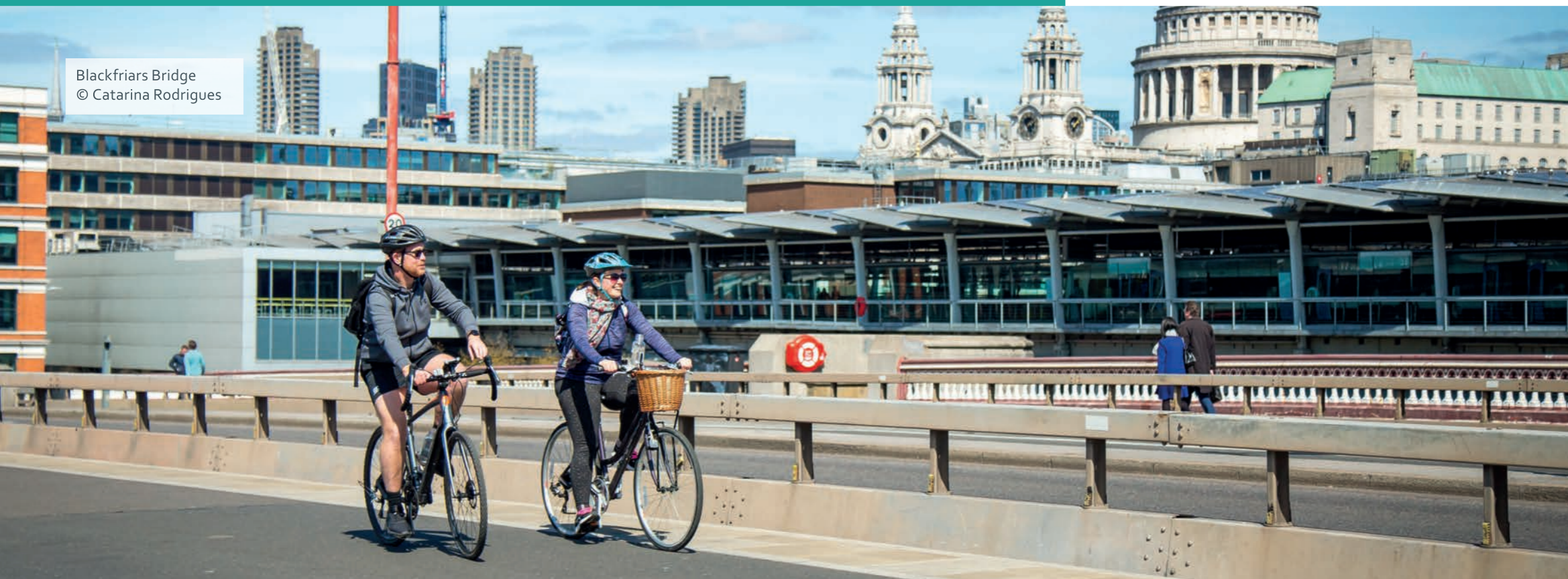
Blackfriars Bridge