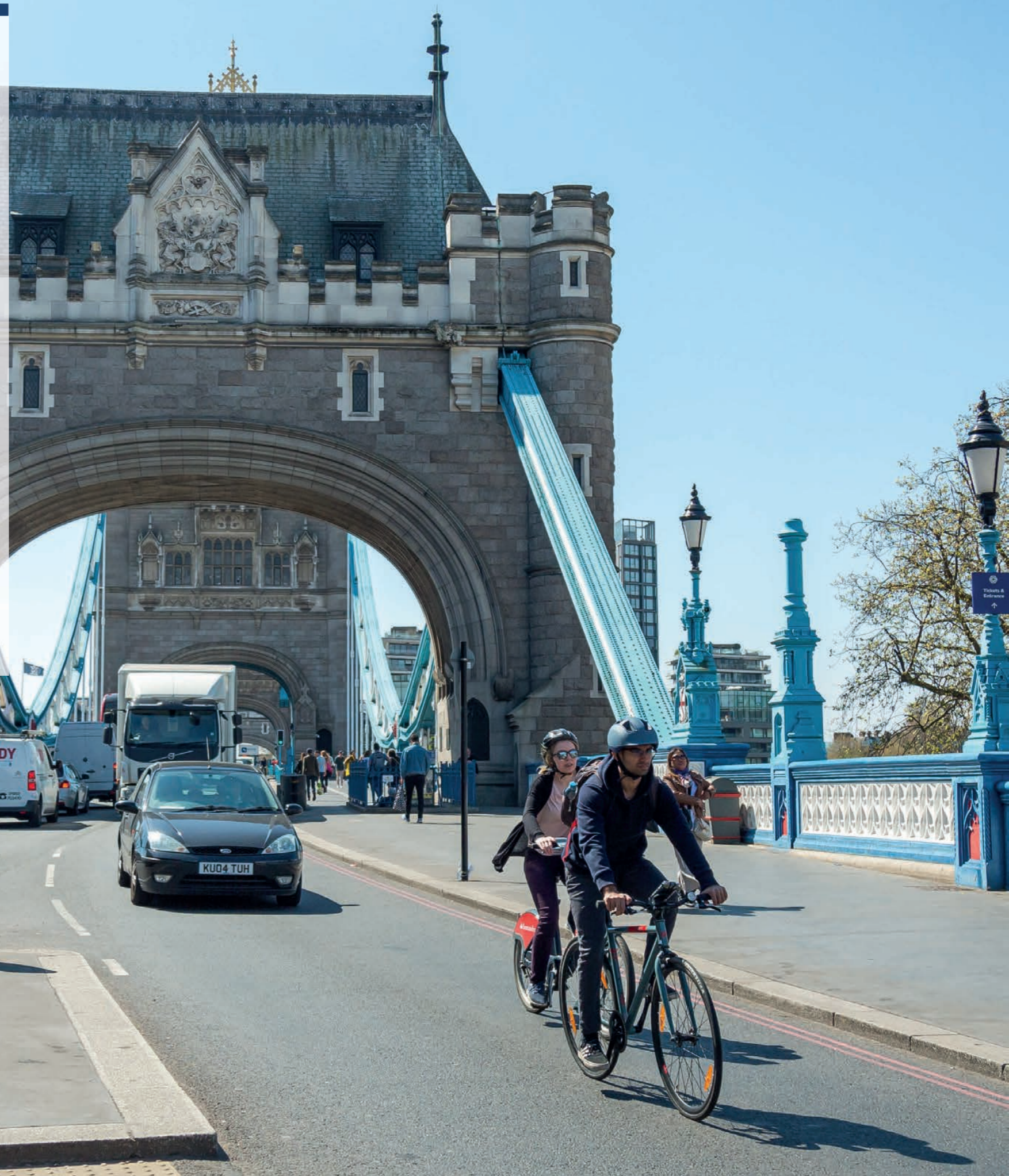
Front cover: Millennium Bridge © Emmanuel Cole Inside cover: Tower Bridge © Emmanuel Cole