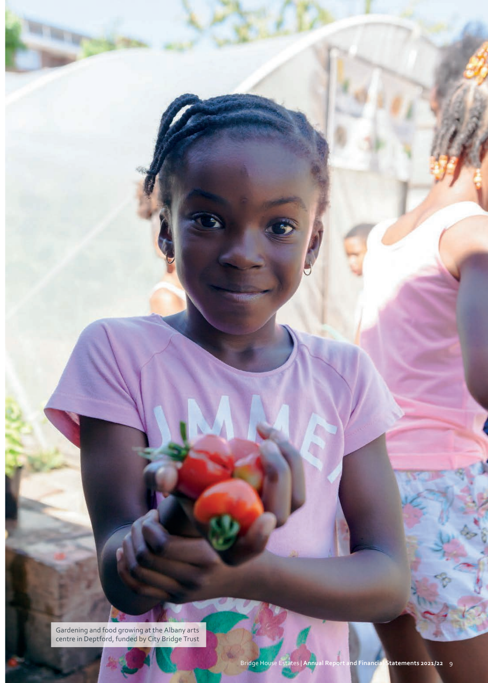
Gardening and food growing at the Albany arts centre in Deptford, funded by City Bridge Trust

The administrative details of the charity are stated on pages 60 - 61.