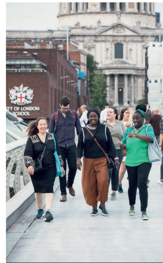
Millennium Bridge

Discussions have continued with the developer of Colechurch House over the replacement of the footbridge over Duke Street Hill which provides access from London Bridge to London Bridge Station.