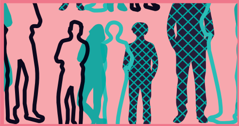
Diverse Engaged Communities