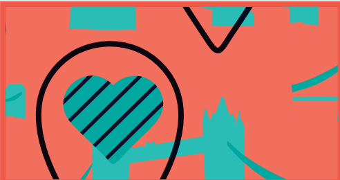
Vibrant Thriving Destination