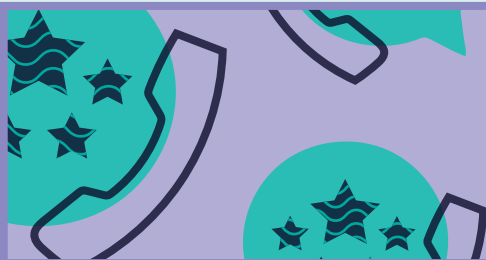
Providing Excellent Services