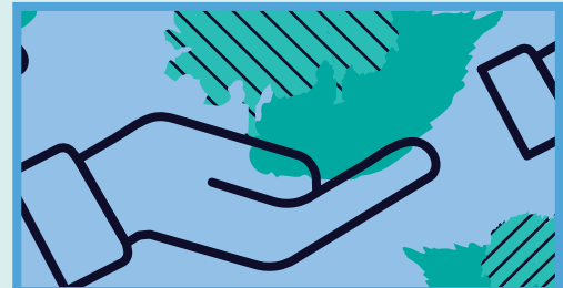
Flourishing Public Spaces